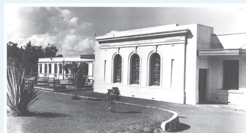
Historic Huia Water Treatment Plant 1928 – future use to be determined

Or visit www.watercare.co.nz/About-us/Projects-around-Auckland